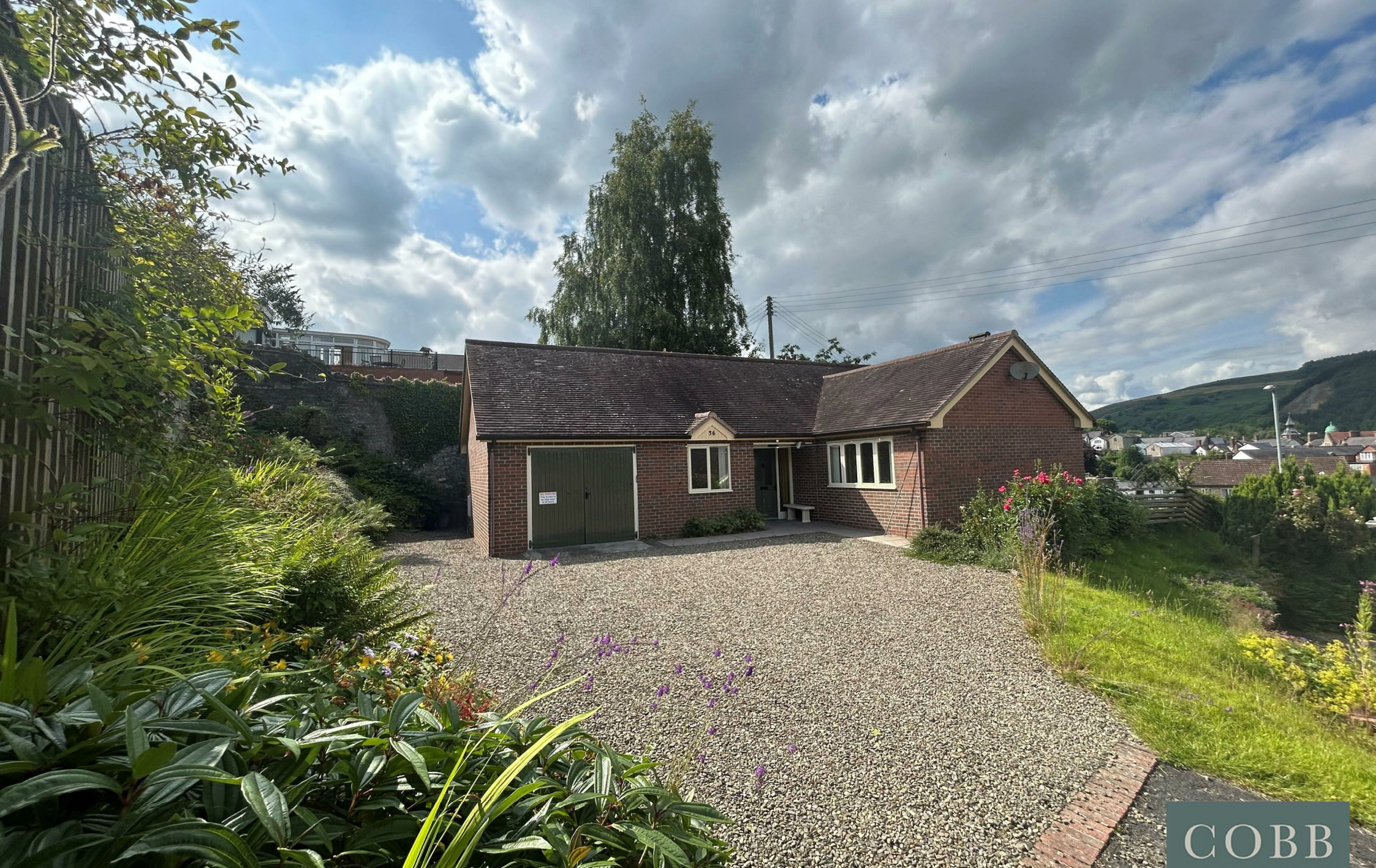
36, Underhill Crescent, Knighton, LD7 1DG Guide Price £295,000